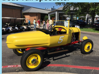
2016 Keels & Wheels photo

'Boat-Tail' is from two 1947 International pickup hoods, 4 cylinder Model A engine with Stromberg downdraft carburetor, & modern intake manifold, Kelsey 16" 'bent spoke' wheels, and rebuilt electrical system.