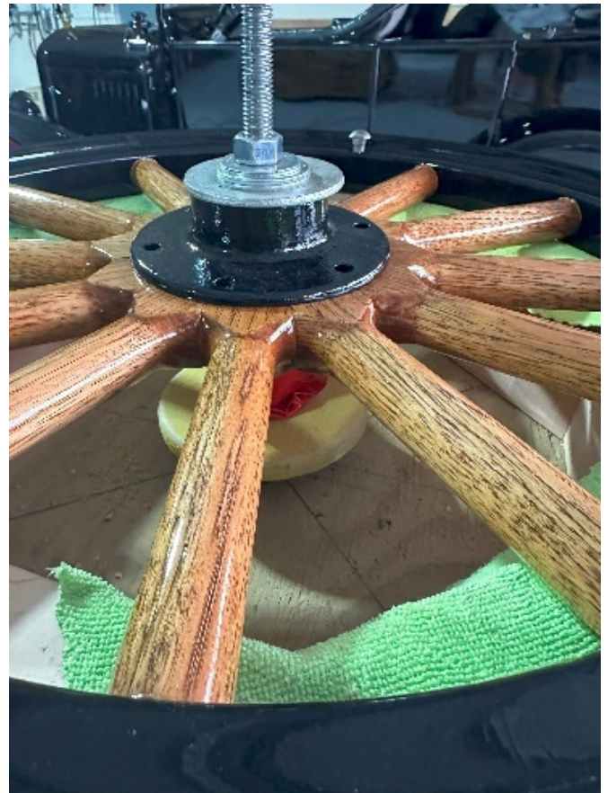
Here is the pressed in spokes prior to drilling holes for the hub bolts.