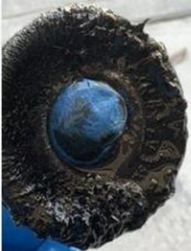
Looks like a great investment.