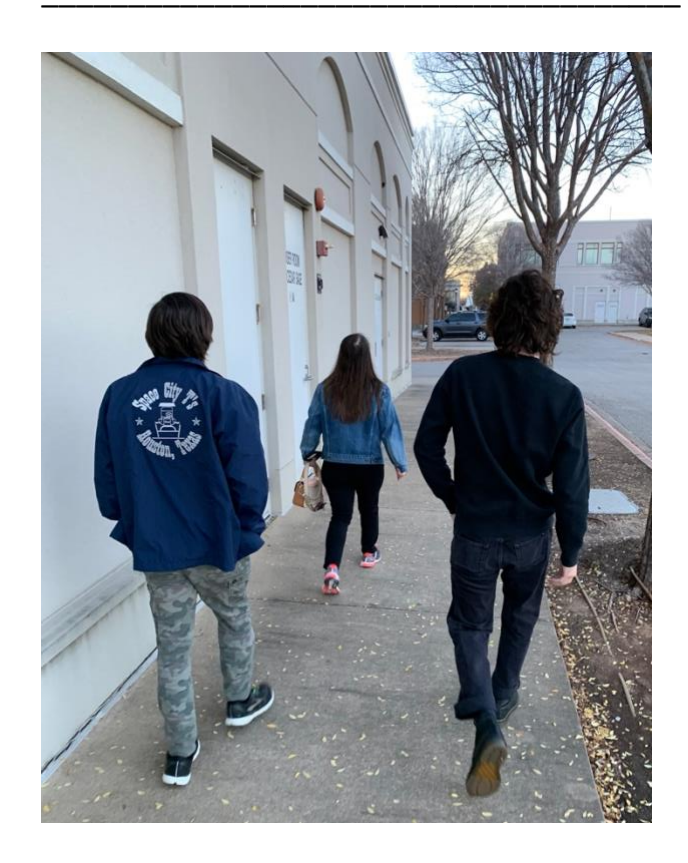
Photo of a man with a very nice jacket seen on a Dallas street, received in an e-mail from Bill Severn.

Here we are with demountable rims painted, new liners, tubes and tires installed. My wife is feeling much better about the Model T with the new tires!