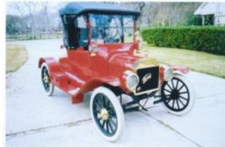
1915 Roadster ('Lil Red)

Contact: Gaylord Willet — Montgomery, Texas 936-448-1550